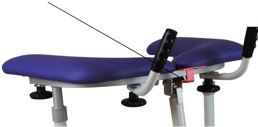
Figure 1: The display of the trigger for height adjustment