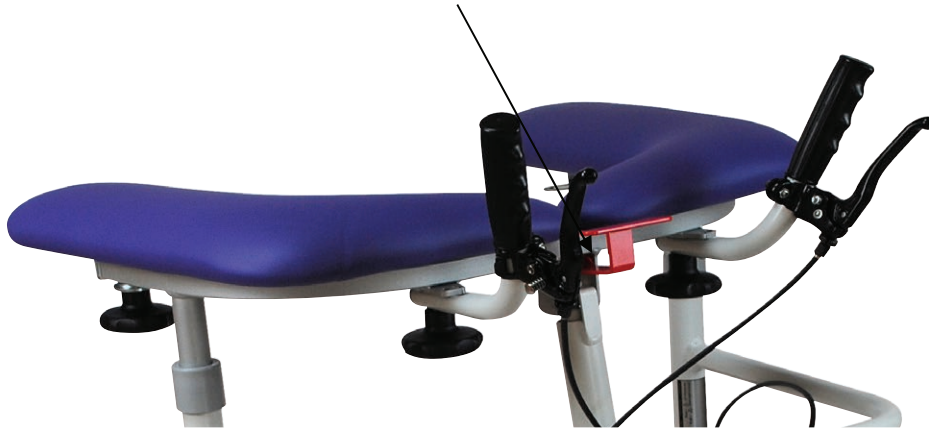
Figure 1: The display of the trigger for height adjustment