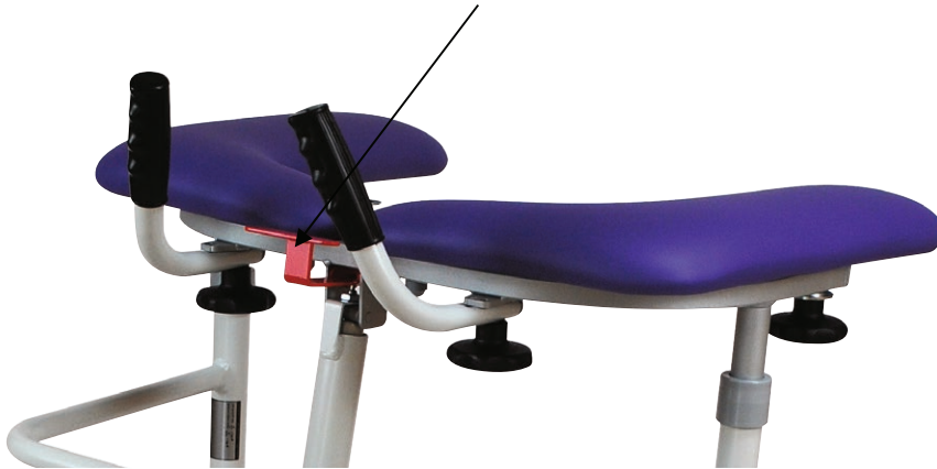
Figure 1: The display of the trigger for height adjustment