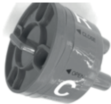
Fig. 2 Turn the dial to OPEN position to release air.

IMPORTANT: Please ensure that all care staff are trained and familiarized with the mattress and this function.