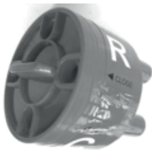
Fig. 1 Turn the dial to CLOSE position to release air.

In the event of cardiac arrest, turn the CPR valves to the OPEN position for fast deflation the air mattress. (Fig. 2)