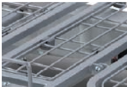
Metal mesh sleeping surface

The comfort sleeping surface has flexible spring elements, which means it adapts optimally to the body and is effective at helping to prevent pressure sores.