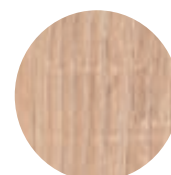
Sonoma Oak light