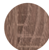
Truffle Sonoma Oak