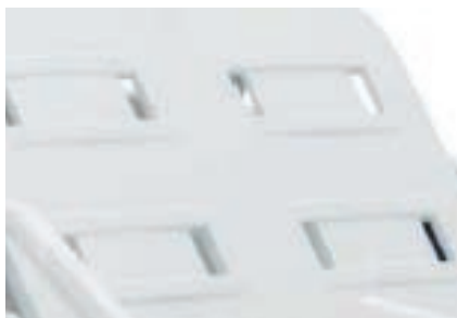
Comfort sleeping surface